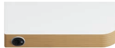
Wide 12 × 75 × 30 cm 4,7 × 29,5 × 11,8 in