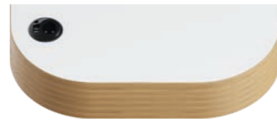
Regular 13 × 70 × 28,5 cm 5,1 × 27,5 × 11,2 in