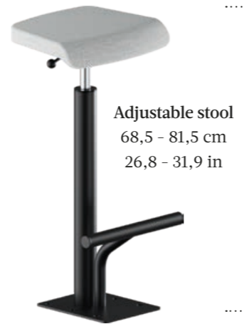
Adjustable stool 68,5 - 81,5 cm 26,8 - 31,9 in