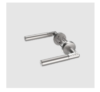
ELECTROMECHANICAL CODE LOCK handle can be used to limit access to a pod only for users with a number code.