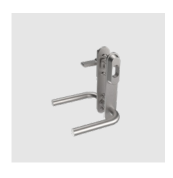
SMART LOCK COMPATIBLE is a kit of parts that allows selected smart locks and key locks to be installed in Framery O.