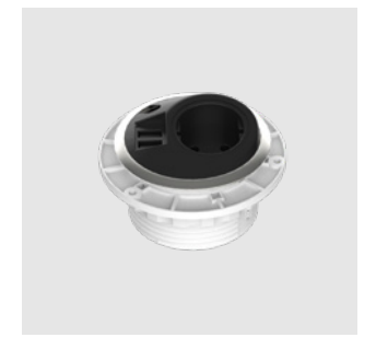
POWER OPTIONS includes outlets with or without two charging USB-C+A sockets and a LAN cable lead-through.