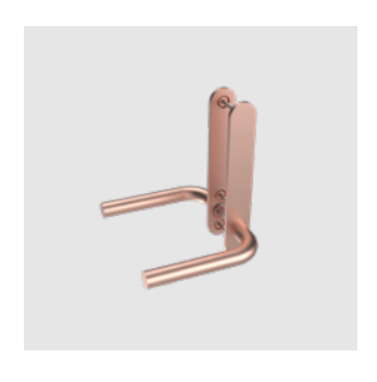
COPPER-PLATED DOOR HANDLE helps to prevent the spread of viruses. According to a study by Centers for Disease Control and Prevention (CDC), viruses disintegrates quicker after landing on copper surfaces than on plastic or stainless steel surfaces.