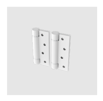
SELF-CLOSING HINGES can be used to limit the opening of doors and to make sure that they are not blocking passageways. Available in black and white