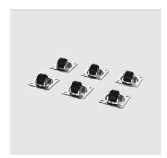
MOVABILITY KIT allows you to easily relocate your Framery O without disassembly. This kit includes six castors to make it easier to move the pod.