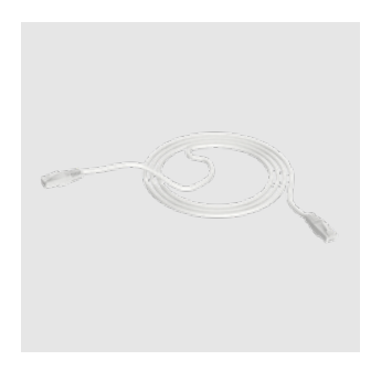
LAN CABLE 7 m.